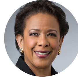
Hon. Loretta Lynch Paul, Weiss, Rifkind, Wharton and Garrison