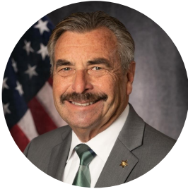
Charlie Beck Former Chief, LAPD