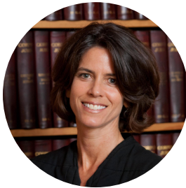
Hon. Tina Nadeau New Hampshire Superior Court