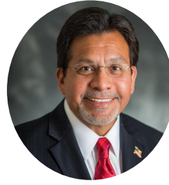
Hon. Alberto Gonzales Dean, Belmont University College of Law