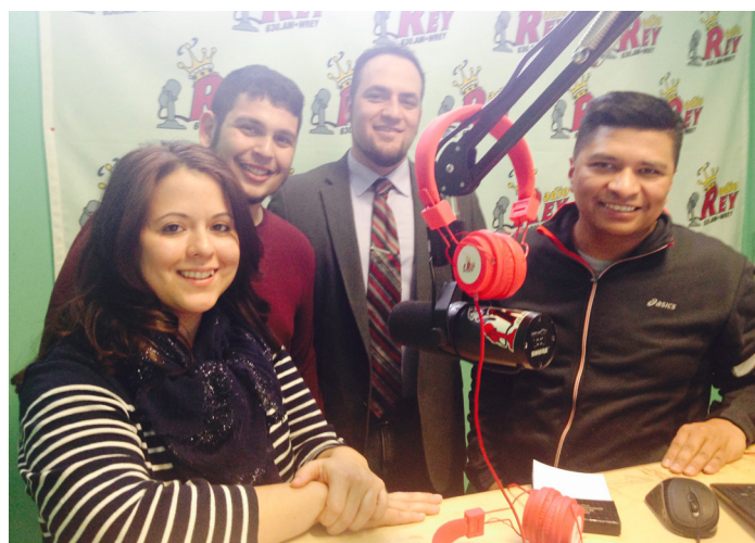
Staff and Amig@s raising awareness on the airwaves

The Amig@s initiative is so powerful because it builds a network of youth and adult leaders committed to preventing violence