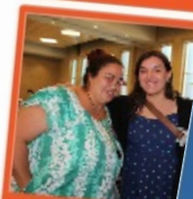
We want to hear